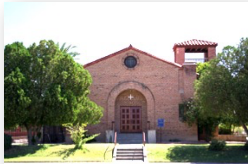
Our Historic "First Presbyterian Church" Florence worship location

The Mission of the Desert Hope Presbyterian Church Is to share Jesus Christ through word and action with all whose lives we can touch.